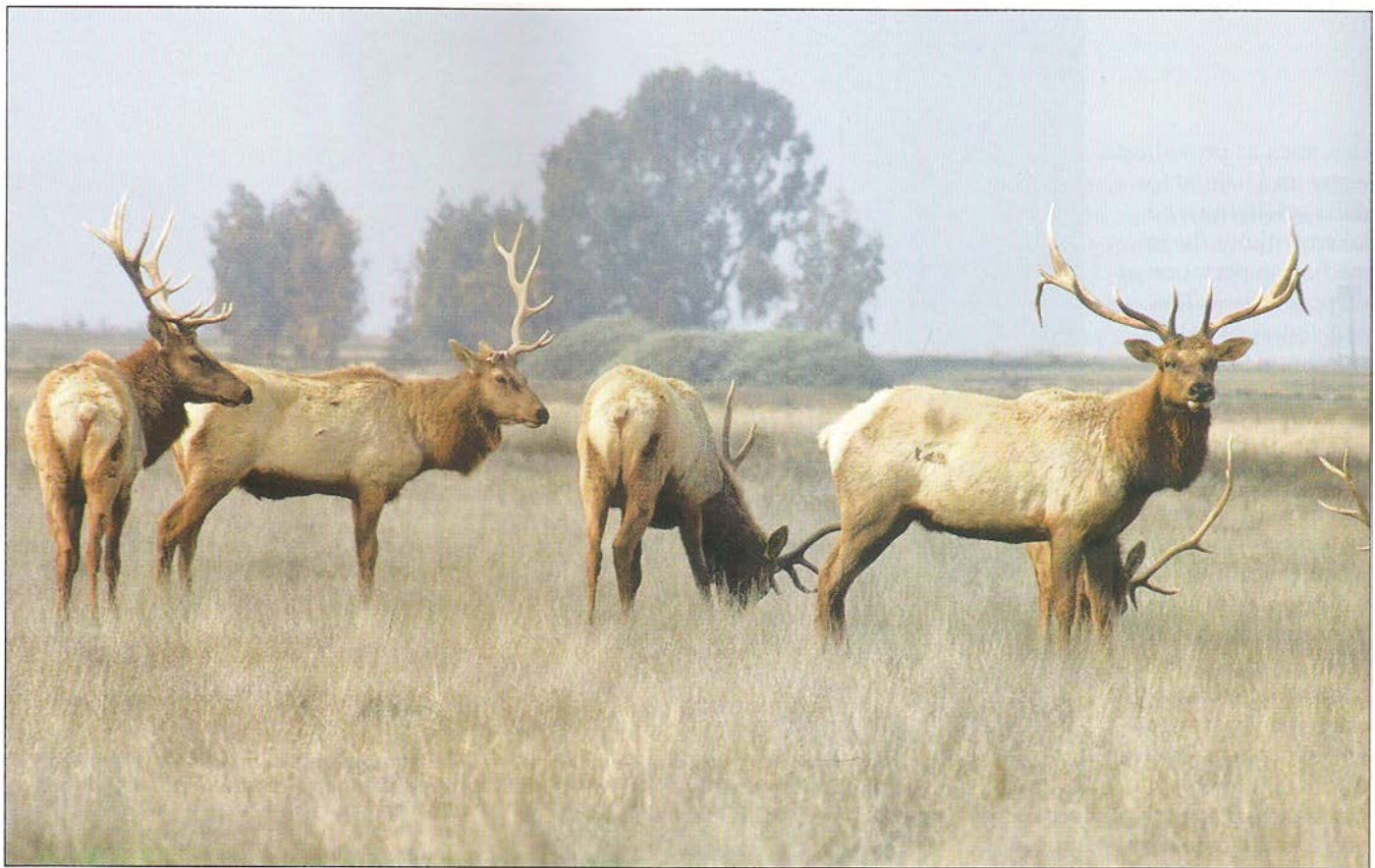
B. Moose Peterson/WRP