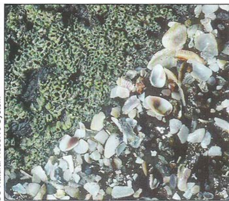
Southern California tide pools