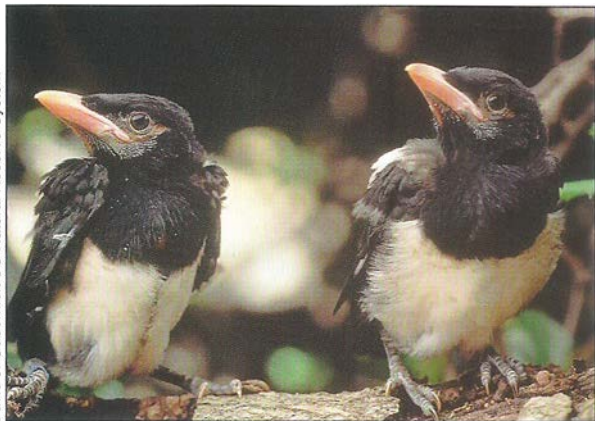
Yellow-billed magpie nestlings ( Pica nuttalli )