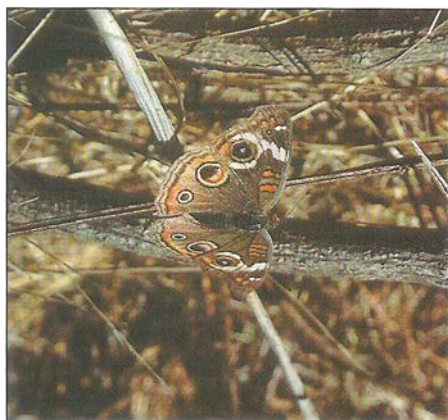
California buckeye butterfly ( Junonia coenia )