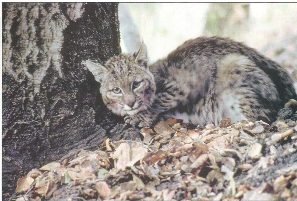
Bobcat ( Lynx rufus )

First, the "redundant species" hypothesis (Walker 1992; Lawton 1994; Lawton and Brown 1993) suggests that a minimal level of diversity is required for proper ecosystem functioning, but beyond that adding or deleting species has no detectable effect. More than one species can play the same role or provide the same service in the functioning of a system, so that if one is lost its