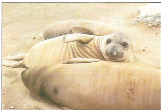
Northern elephant seal pup ( Mirounga angustirostris )

Each species is the repository for an immense amount of genetic information. The number of genes ranges from about 1,000 in a bacterium and 10,000 in some fungi to 400,000 or more in many flowering plants and a few animals.