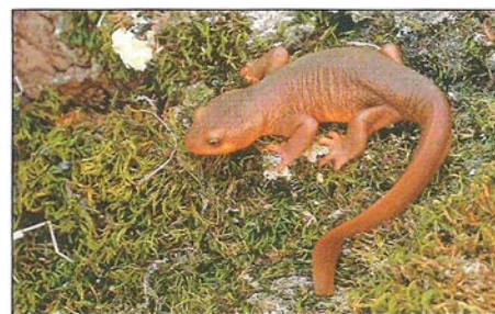
California newt ( Taricha torosa )