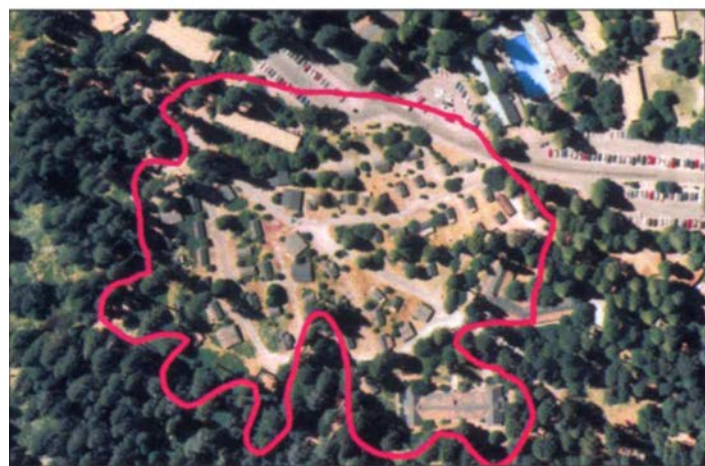
Aerial photos of Yosemite Lodge area in 1975 (upper), 1997 (lower). Area in which root disease was detected is outlined. Note the significant reduction in trees due to root disease and hazardous-tree removal.

openings in the forest canopy which continue to enlarge as the fungus moves into adjacent trees. Following the death of a tree, H. annosum is capable of living as a saprobe. Receiving nourishment from the decaying tree, it slowly decomposes the underground root wood for a number of years. Because of this saprobic phase, the fungus has the capacity to infect regenerating conifers within a gap for 30 to 50 years. It is unlikely that H. annosum will infect trees already dead from other causes, as roots of these trees are rapidly colonized by competing fungi.