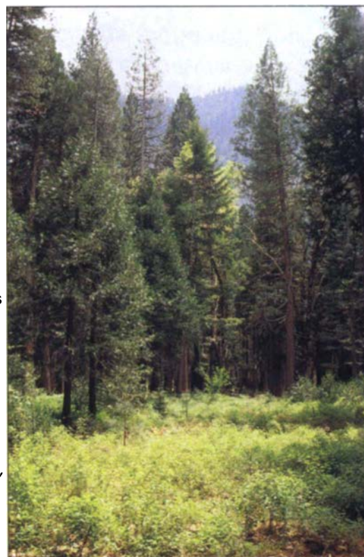
Sentinel Beach gap. Berries have replaced trees in the area where the stand has been opened due to root disease. Dead and dying trees can be seen at the gap margin.

Once it became clear that root disease was associated with most conifer mortality observed in Yosemite Valley, park managers responded with a vigorous program of hazardous tree removal. Researchers developed a hazard rating system for incense-cedars (work on pines was never completed) to allow on-site workers to identify trees most likely to fail (Srago et al. 1978). As time passed, some canopy gaps ceased enlarging, while many others continued to sustain tree mortality and wind-throw at the gap edges. Discrete gaps often coalesced into large forest openings as tree mortality and removals continued. As part of a program to remove potential H. annosum -infected trees from the developed areas and prevent further spread of the disease, 247 trees were felled in