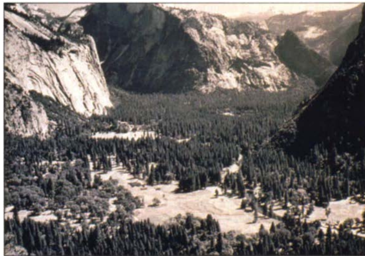
East end of Yosemite Valley from Columbia Point in 1899 (left), showing open meadows, scattered oaks and large pines. Right, view in 1961 showing development of dense conifer forest.

root disease in conifers and hardwoods will play an important role in determining the direction of vegetation management in the park, particularly Yosemite Valley. Our preliminary surveys indicate that root disease is the most common disturbance associated with canopy gaps in Yosemite Valley (as compared to bark beetles or wind-throw). Since 1970, well over 200 canopy gaps associated with root disease have been recorded in Yosemite Valley, and approximately one-half of these have been mapped. In some developed areas of the valley such as campgrounds and lodging facilities, one-third to one-half of the forested area is associated with root disease infestations in conifers (authors, unpublished).