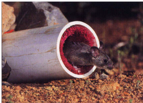
Pesticide rubs off the treated carpeting onto the wood rat as it enters the pvc pipe. The method has been very effective for reducing tick populations that may spread Lyme disease.

The bait tubes, which are not commercially available, are made of 20-inch lengths of 4-inch pvc pipe. Cracked corn, used as bait, is embedded in wax and fastened to the center of the