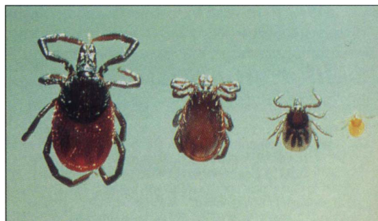
From left to right, female, male, nymph and larva of the western black-legged tick. This tick is the primary vector of the Lyme disease spirochete in California.