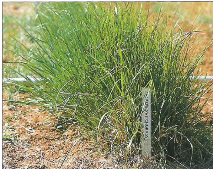
The four warm-season grasses with highest four-year average forage dry matter yields were (top left) Indiangrass, (top right) little bluestem, (above left) big bluestem, and (above right) switchgrass.