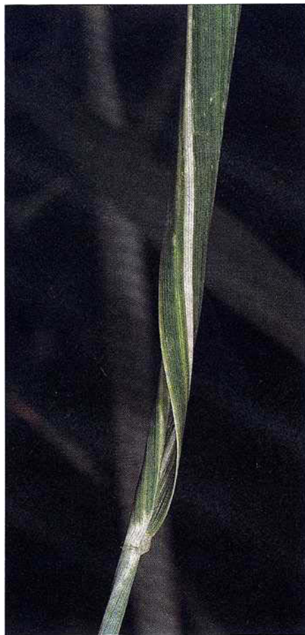
Russian wheat aphids feeding on a leaf (top) inject a toxin injected into the plant, causing leaves to streak and curl (above).

The Russian wheat aphid is spreading rapidly through California. The pest injects a powerful, growth-inhibiting toxin into grain plants. Without insecticide treatment, crop losses can be severe.