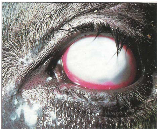
Pinkeye, an infectious bacterial disease in cattle, can cause a painful corneal ulcer that in some cases may lead to blindness.

The calves were examined three times weekly for signs of ocular inflammation. At the time of each examination, a clinical severity score was assigned to each eye, and