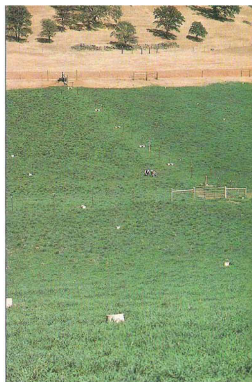
Short-duration, or intensive, grazing systems require monitoring of the pastures to ensure an appropriate stocking rate. Researchers above are examining the regrowth of irrigated pasture plants in a study paddock.

We used a stocking rate estimator based on the total animal unit (1,000 pounds of body weight equivalent) days per acre inch of forage removed (AUD/IFR) in a 3-day grazing period. By trial and error during the first year, we developed an AUD/IFR of