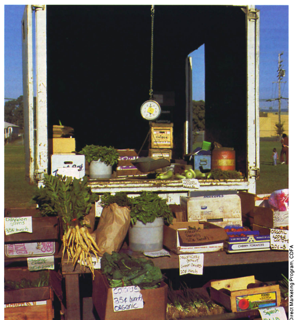
Direct marketing in California has grown rapidly in recent years but still accounts for less than 1 percent of the state's total fruit and vegetable production.

Tarmers receive only a small share of the retail food dollar in the wholesale-retail marketing system — about 28 to 29 percent for fresh fruits and vegetables in 1984, according to the U.S. Department of Agriculture (USDA) Agricultural Outlook. Direct marketing gives farmers an opportunity to increase profits by cutting out the middle layers and receiving a larger share of the retail dollar.