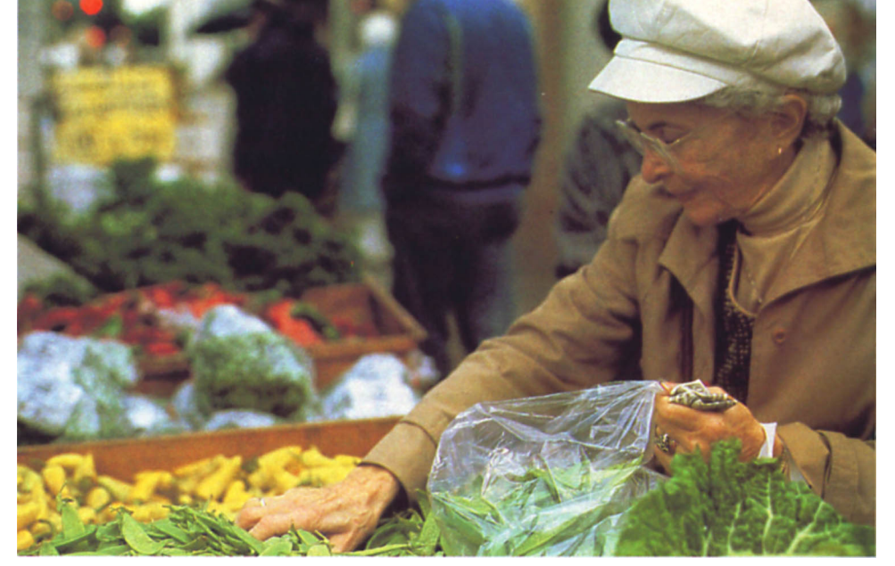
Fresh produce and low prices