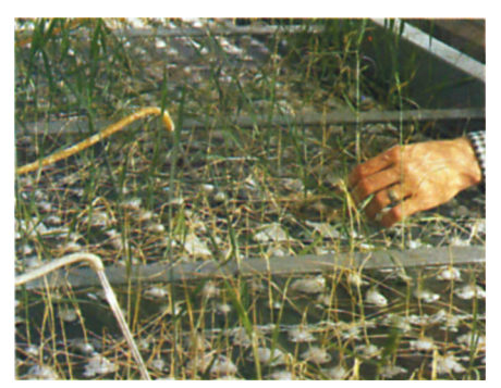
Surviving varieties of wheat growing in water half as saline as sea water will be tested in the field in search for highyielding, salt-tolerant strains.

co-workers have identified salt-tolerant cereals (barley, triticale, and wheat) and tomatoes by growing them in salinized solution-tank cultures throughout their entire life cycles. A plant must germinate under high salinity (50 to 75 percent the salinity of seawater) and grow to maturity to be considered salt tolerant. By this method, they identified salt-tolerant wheats, including varieties with known salinity tolerance such as Kharchia from India. The next step was to evaluate the selected materials in a number of California field sites with natural salinity gradients. Each barley or wheat entry was subjected to a wide range of salinity, and its performance compared with that of control varieties. A response curve was obtained by measuring yields obtained from locations differing in soil salinity.