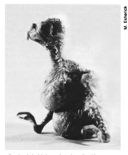
Cockatiel chicks, when hatched in an incubator, must be hand-fed until they are weaned at four to six weeks of age.

Comparisons have recently been made between pairs maintained in cages that were 1 by 2 feet by 1 foot high and pairs in cages 1 by 4 feet by 2 feet high, plus either a wood or a stainless steel nest box. All pairs had produced eggs previously. Most of them had hatched eggs and many had reared young. Three-quarters of the birds had bred in 1- by 2- by 1-foot cages with stainless steel nest boxes, while the remaining birds had bred in flights (roomsize cages) with wood nest boses. The pairs were distributed into four groups with each group containing equal num-