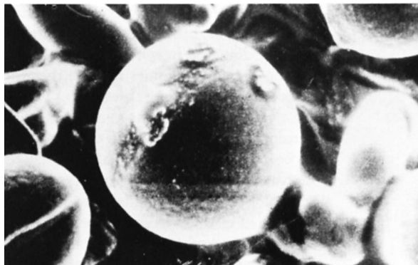
Scanning electron micrograph of pollen grain germinating on surface of stigma.

In practice, virgin stigmas are pollinated and exposed to a low temperature challenge. Under these controlled conditions, only those pollen genotypes conferring germinability