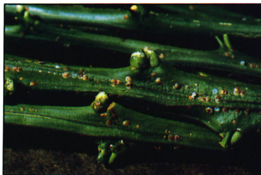
Above: Budwood sticks infested with California red scale.

Insecticides in combination with petroleum oil were tested as a dipping solution for their effectiveness in eradicating California red scale, citrus red mite, and Comstock mealybug. Field experiments have shown that dosages of pesticides effective against