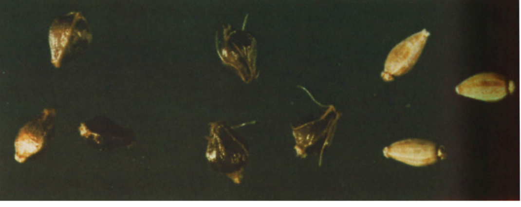
The three short-growing spikerush species have similar foliage, but their seeds differ: dwarf spikerush (left); barbed spikerush (center); and slender spikerush (right).

they grow vigorously as long as their roots remain wet. In contrast, the foliage of submersed waterweeds dries up when it is exposed to air, and the plants cease active growth. Because the spikerush plants continue to grow well in wet soil, they invade areas occupied by the dried waterweeds. The spikerush plants also appear to have a competitive advantage in inundated habitats, because they generally continue vegetative growth after other waterweeds become senescent in the fall.