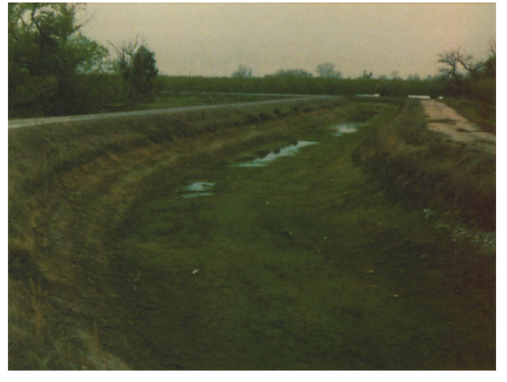
Dense sod of dwarf spikerush covering the bottom of the Corning Canal has replaced the sago, curlyleaf, and slender pondweeds that previously grew there. Water flows have increased as a result.

California's certified farm market program is alive and healthy. Although only one market is more than a decade old, they have developed a cadre of satisfied regular customers. For most, the period of initial adjustment is over and the managers and small farmers can now look forward to consolidation and expansion. Conditions of certification make it unlikely that these markets will grow beyond a certain size. The bustling public markets in other cities, such as Pike Place in Seattle or Boston's Quincy Market, are a mix of coffee shops, boutiques, craftspeople, as well as small growers. The certification regulations are likely to keep California's community markets small, local, and "pure."