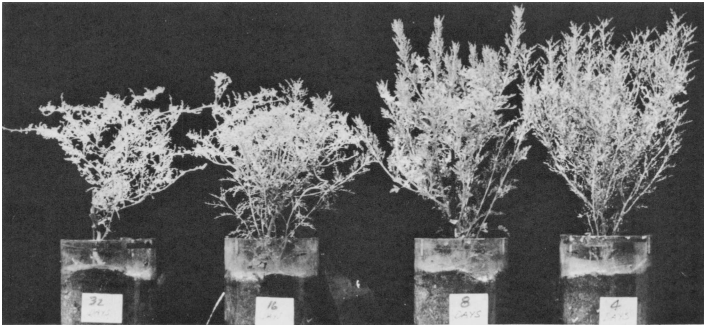
Ambrosia dumosa plant irrigated (from right to left) 4, 8, 16 and 32 days after reaching -60 bars soil moisture potential. The plant watered at 32 days is dead. New foliage is growing from near the base of the plant watered at 16 days, but most of the foliage is dead.

however, no severe desiccation when the water potential was below -40 bars.