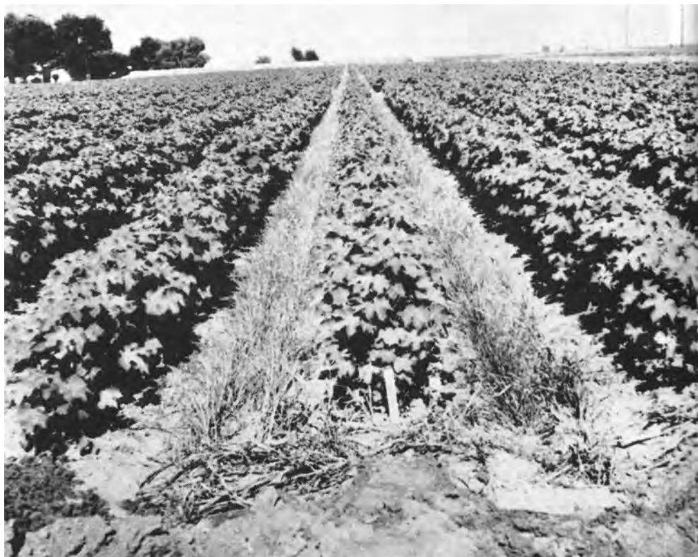
Sudan, before oiling, grown in irrigation furrows between cotton rows.

The rate of advance of water after the mulches were established was measured at each irrigation. The time required for the irrigation stream to reach the lower end of the field was nearly doubled by the sudan and significantly increased by the millet, as shown in the graph. Decreasing the rate of advance of water during post layby irrigations can be helpful in improving irrigation efficiency on soils with low infiltration rates or on excessive slopes.