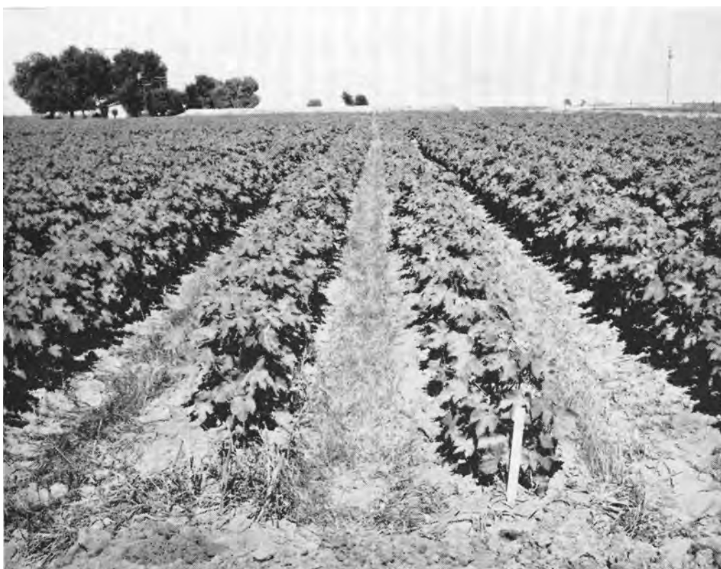
Millet, before oiling, grown in irrigation furrows between cotton rows.