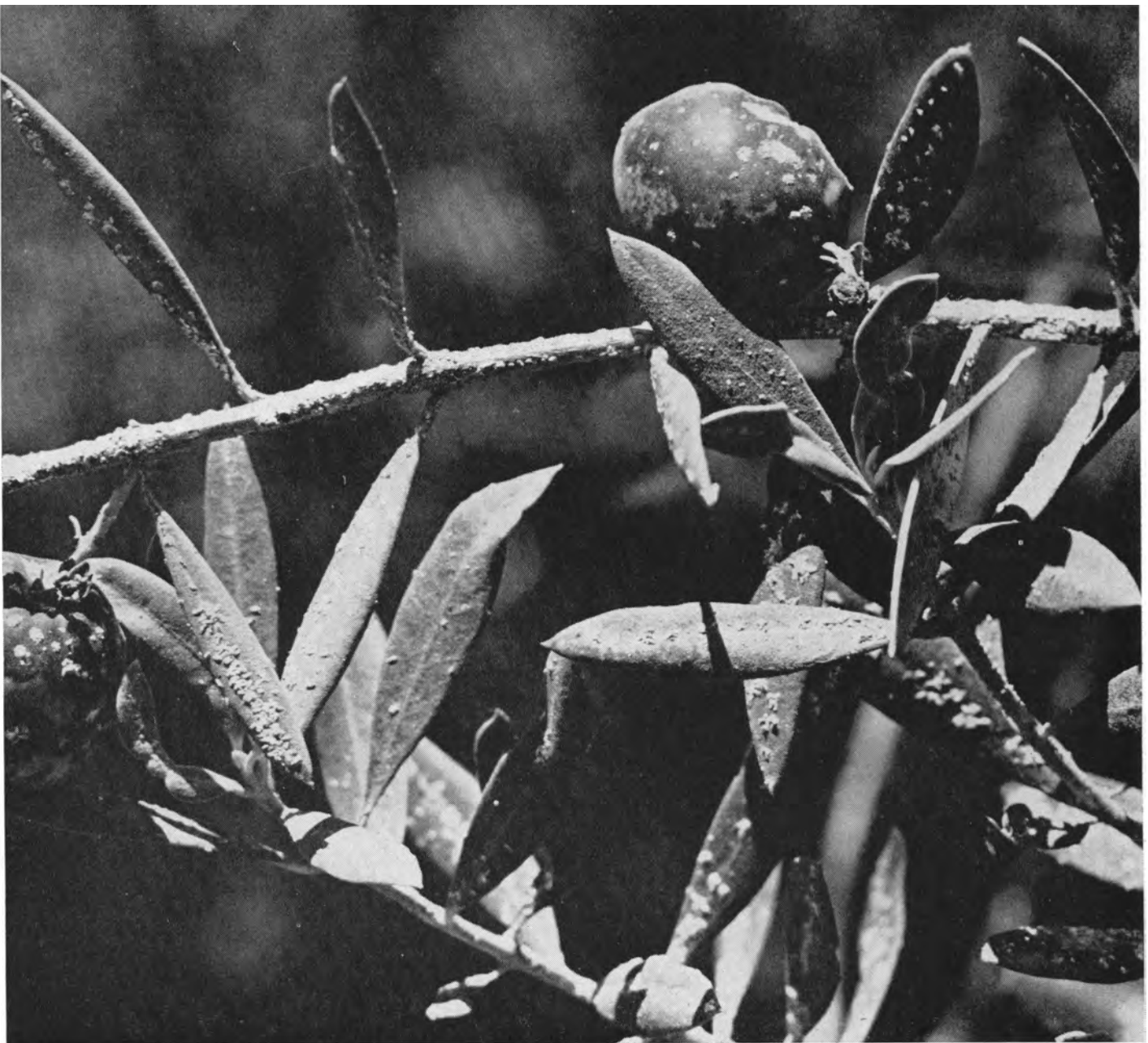
Fruit damaged by olive scale. Note scale encrusted leaves and twigs of the DDT-treated check tree.