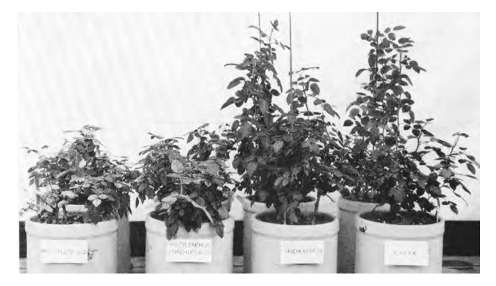
CALIFORNIA AGRICULTURE, SEPTEMBER, 1958

Roses grown in soil infested with root-lesion nematode—two crocks on left. Roses not infested with root-lesion nematode—two crocks on right.