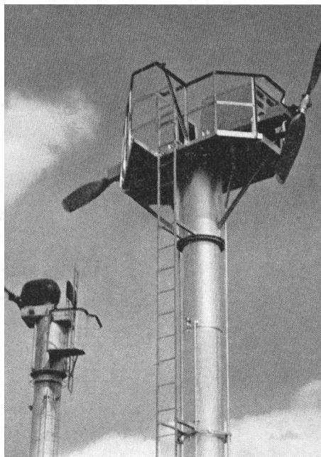
Two modern wind machines erected side by side for comparative tests. The whole tower top rotates slowly bringing a blast to a given direction every four or five minutes. The propellers are mounted 32 feet above ground and directed slightly downward so that the air blast penetrates the orchard about 80 feet away and produces strong low-level gusts from about 150 to 300 feet. The single electric 90 bhp machine is specially designed for down-drift operation, taking four minutes to sweep the lower 180° but skipping around the up-drift 180° in 1½ minutes. The dual engine machine, each operating at 65 bhp turns 40° per minute as is usual for square 15-acre tracts.

pared with the three stations in the orchard as previously described, up-drift or 250 feet to the side of the operations area. Sometimes there seemed to be pulse flow with peak velocities as large as the operation responses to be measured.