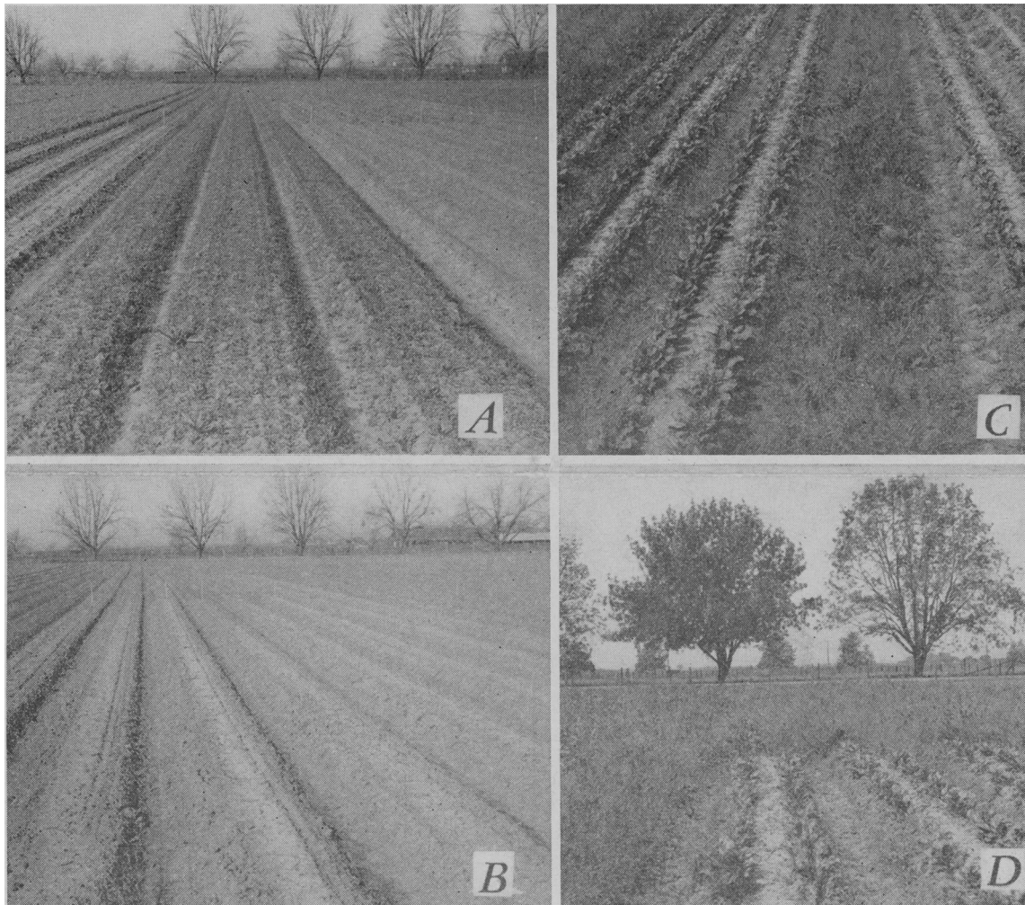
Control of weeds in sugar beets by the use of pre-emergence sprays. A. Normal weed growth at the time of spraying. B. Adjacent soil after spraying. Beet seedlings appeared in these plots within five to six days after spraying. C. The strip of weedy growth in the middle was unsprayed while the soil on either side was sprayed. D. The plot in the right foreground was sprayed, the surrounding soil was not sprayed. Plots C and D were neither cultivated nor irrigated. The photographs of these two plots were taken about 45 days after spraying.

Decorticated sugar beet seed was drilled in at three different depths: 1 inch, 1½ inches, and 2 inches. A