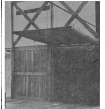
Single-car cabinet blancher. Steam distribution pipes are at back of cabinet and on door.

The cars should be pulled from the dehydrator at a fruit moisture content of 30 to 35 per cent. When the fruit has cooled and the desired moisture content reached, it should