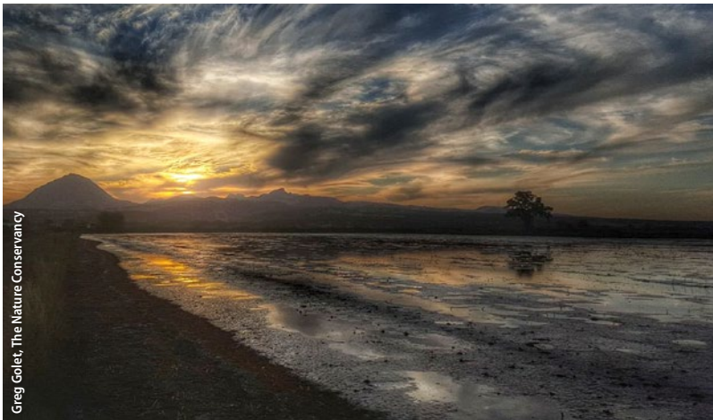
Greg Golev, The Nature Conservancy

Conservation land use options that can be part of the solution for meeting groundwater sustainability include: top left , temporary flooding of farm fields at the right times of year to create “pop-up” wetlands for wildlife; top right , wetland and riparian habitat in dedicated recharge basins that can provide high-value habitat for migratory birds and the threatened giant garter snake; bottom left and bottom right , restored riparian corridors along rivers and restored upland grasslands and scrublands, which could reduce the demand for water and provide ecosystem service and human benefits.