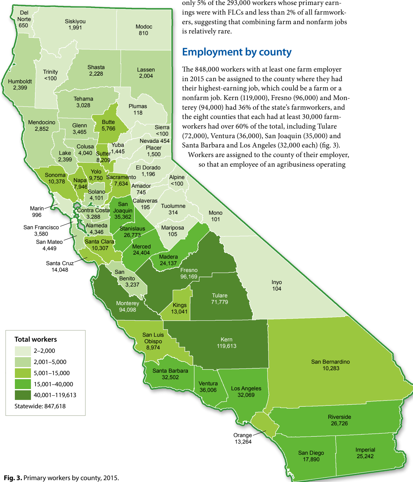
Fig. 3. Primary workers by county, 2015.

Workers are assigned to the county of their employer, so that an employee of an agribusiness operating